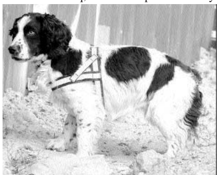
Blaze, undaunted by assassins' attempt

Blaze, also has a special talent for sniffing out guns, explosives and ammunitions. A British newspaper, The Sun, reported Blaze survived a suspected contract killing. Also serving in Southern Iraq, Blaze escaped with only cuts and bruises when the