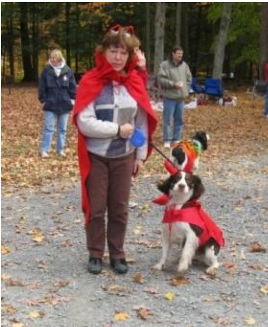
Little Buffalo Picnic