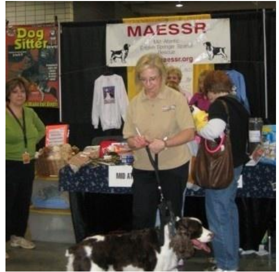
Pittsburgh Pet Expo