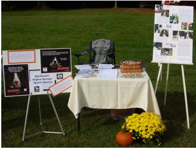
Burlington Pet Expo